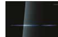
Sigma80 → Touchless flush actuation → Five colour options for light actuation fields

Note: Flush plates available in a choice of colours and finishes.