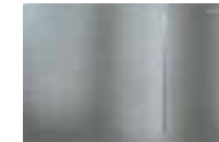
Sigma70 → Easy actuation with minimal force required → Pneumatic hydrolifter servo technology → Floating borderless design