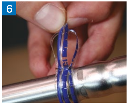
Remove pressing indicator. Check the correct insertion depth has been met.